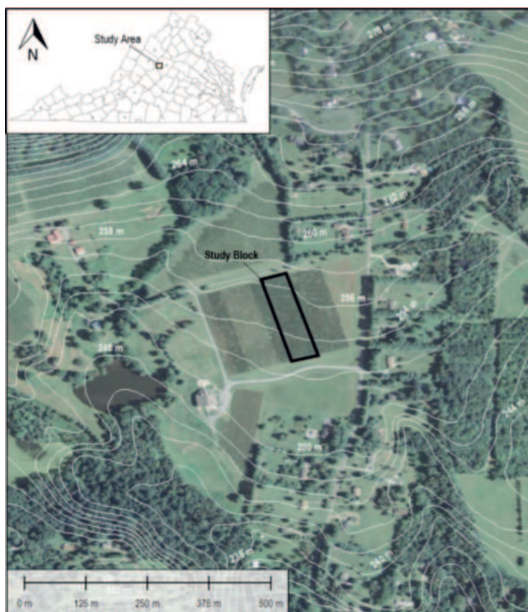
Figure 1: Study block consists of an approximately 0.81-hectare Cabernet Franc block with consistent clone, rootstock, vine age and viticultural practices.

For this work, survey data were collected as individual transect lines and stored in a digital data recorder attached to the instrument. GPS coordinates were constantly streamed from a Differential GPS antenna, worn on the field worker's back, throughout the surveys. The instrument was held at a consistent height of approximately 8 cm above ground surface and was carried at a steady pace along each survey line. EM data were gridded via Kriging and were filtered, contoured and processed into maps using Surfer 12 by Golden Software and Global Mapper by Blue Marble Geographics.