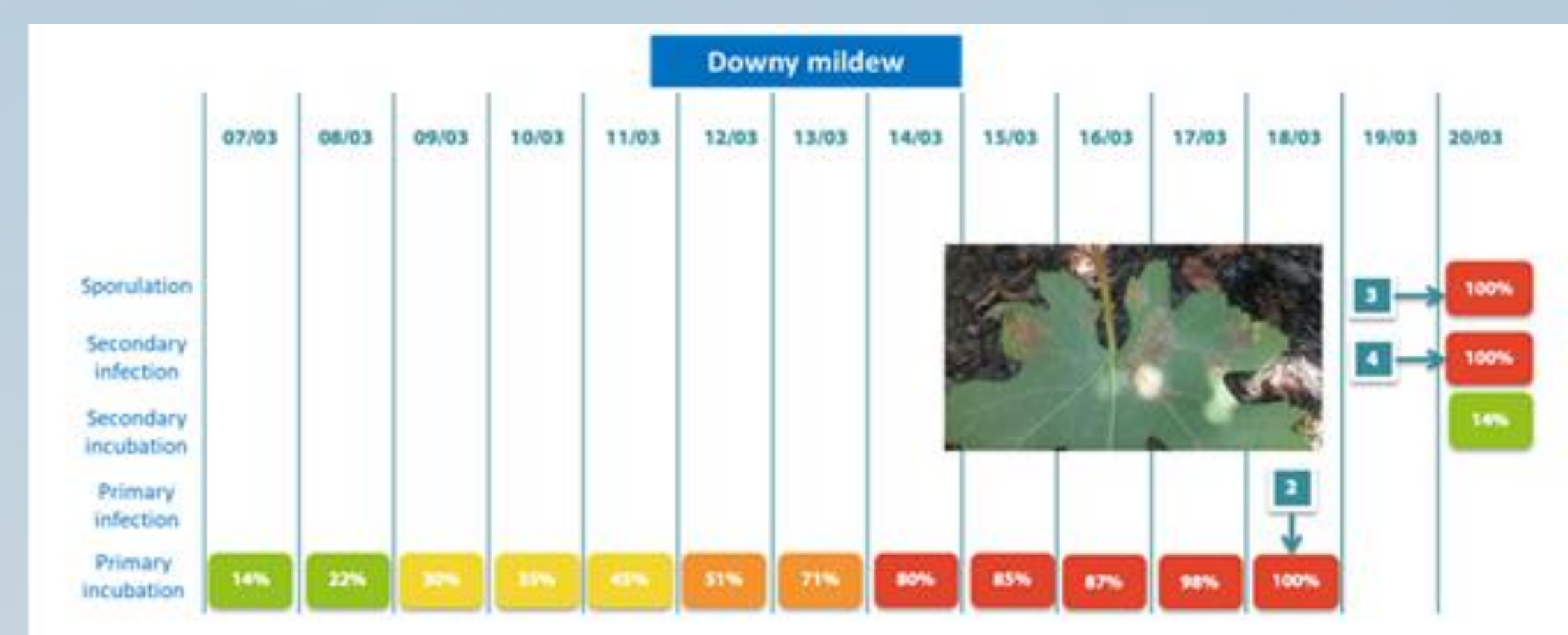
Figure 2. Prediction models for downy mildew.

This cycle is repeated throughout the campaign, allowing the identification of the propitious moments of infection based on meteorological conditions.