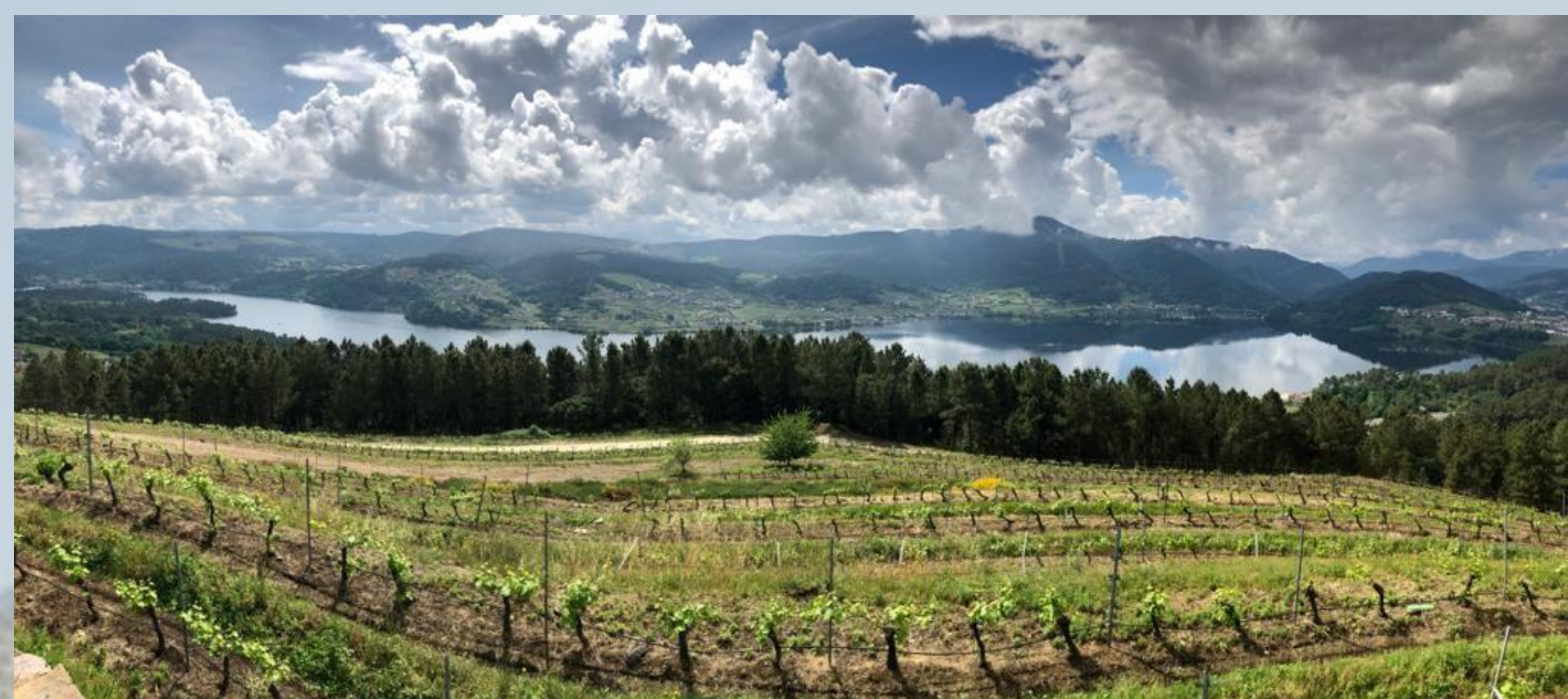
Figure 1. One of the plots under study (A.O. Ribeiro).

To carry out this initiative, an supra-autonomous Operational Group has been created. It is comprised by a total of 11 participants including partners from Galicia and Castilla y León (specifically in the A.O. Rías Baixas, Ribeiro, Valdeorras and Ribera del Duero), as well as subcontracted members and collaborators.