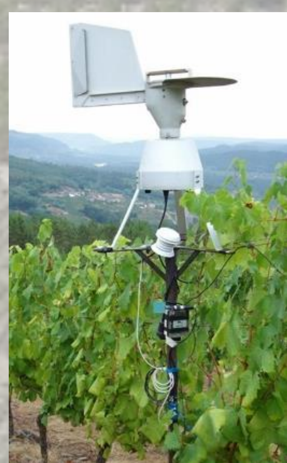
Figure 4. Aerobiological sensor station at the vineyard level.